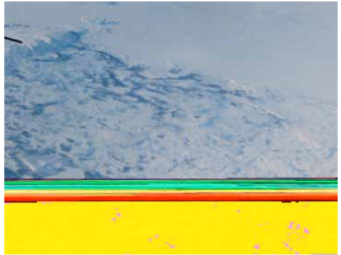
Arctic glitchscape 2646, by Sarah Lewison

It seems noisy in here, but it’s not the same as other work-related sounds, like jackhammers and vacuums that cause eardrum damage to humans, sounds so loud they lead to deafness. It is a more complicated psychological aural entanglement with and within the office. For one, although it’s loud, we can’t be certain about what we hear because we can’t visually verify the relationships that generate these sounds. The HVAC collectivities produce a siren-like chorus that seems to amplify and change in feeling over time. Its songs slowly intrude upon the space, the body, an ambience that inducts, takes hostage by degrees, an always coming that never arrives. We are unable to gauge the spatial relationship this clamor has to us, to measure its distance, nor to keep them at bay. Whether I listen consciously or not, I take the sound personally as an affront that shrinks me in its presence. It feels like something inside is squeezed out. Its wind is drying, dehydrating, even in being heard it is felt. My subjectivity in relation to this sound, office, what this office does, and whatever I am supposed to be doing there becomes muddled, dislocated, diluted. Who is doing and what is it being done to? Timothy Morton writes about how the blurring of foreground and