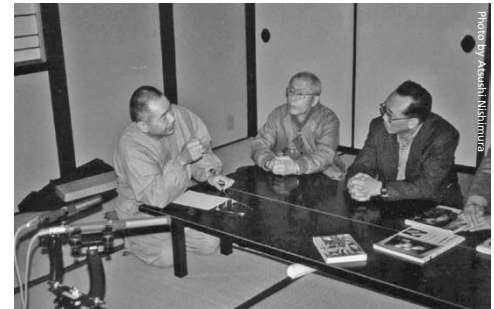
Figure 4—A recording session for creating a soundmonograph. A lot of important information was acquired from such free discussions.

In soundscape studies the relationship between an environment and its subject can be understood from a holistic point of view in which image, mood and memory are included. Therefore, the descriptions of a soundscape have to include elements by which listeners' experiences and imagination can be evoked.