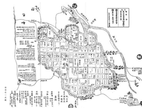
Fig. 1—An old map of Hirano-go published in 1763.

HPN has a unique motto: "no representative, no rule and no membership fee." Such volunteerism has been valued highly in the activities of the Hirano People's Network for Community Development .