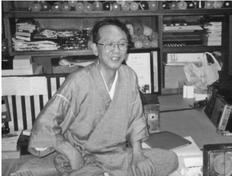
Figure 2—One of the 15 museums' Hirano Film Archives. The top picture shows an exterior of the museum. The bottom shows the museum's director.

HPN started the Hirano Ecomuseum Project in 1993. The project consists of a lot of tiny museums utilizing the ordinary facilities such as temples, shrines, stores, public spaces and private houses. Each director develops a plan for each museum's exhibition. The plan is based on the director's own understanding of the community and what is important to include. The aim of the museum project is to transmit to visitors—while strolling around the district visiting the many small museums available—a kind of holistic sense of the area, an image or atmosphere of the town.