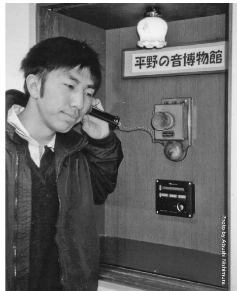
Figure 3—CD listening system in the core facility at Senkoji-temple. A multi disc player is combined with an antique phone.

HSM exhibits the soundscapes of the area using a variety of media. The sound map indicates the geographical locations of the facilities, describes the purpose of the HSM, transmits the testimonies of "earwitnesses" [Schafer 1974], shows a sound walk route around the area and listening points where characteristic sounds can be heard. The website has given participants a lot of opportunities to communicate with others. The World Wide Web is especially useful for international exchanges and in the future, it will constitute an interface between users and the digital archive section of the HSM.