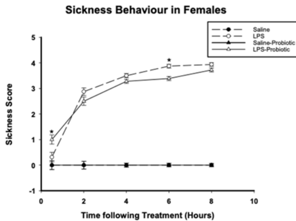
Figure 2. Mean ( \pm SEM) sickness score in 6-week-old female ( n = 40 ) mice treated with saline or LPS and exposed to probiotic or milk control. The asterisks (*) denote significant treatment differences between probiotics and the milk control. ( p < 0.05 ) at specified time points.