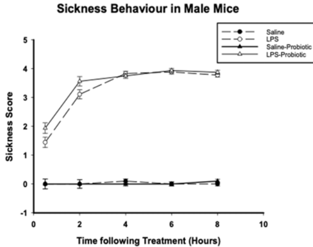
Figure 1. Mean ( \pm SEM) sickness score in 6-week-old male ( n = 40 ) mice treated with saline or LPS and exposed to probiotics or milk control.